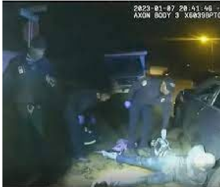
EMT Sandridge declines to use his blood pressure cuff to evaluate Tyre.