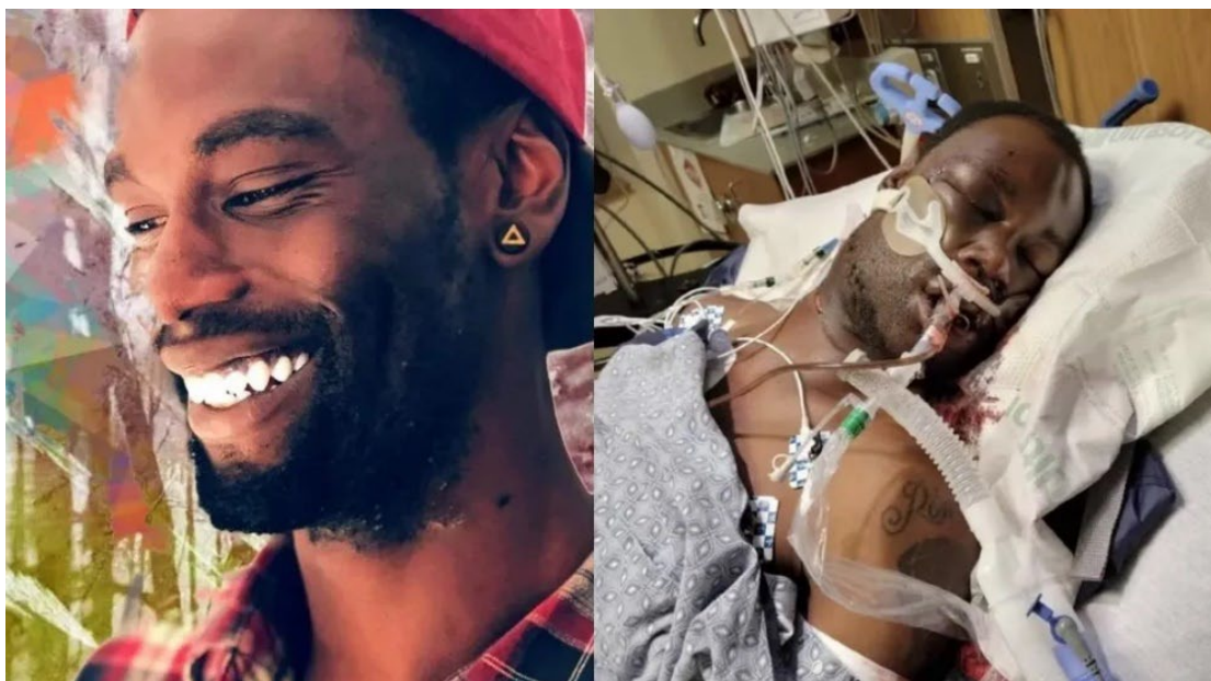
The picture on the left shows Tyre Nichols in 2021.

This lawsuit is a civil indictment under the laws of the United States against the City of Memphis, its Police Department, its Chief of Police, the SCORPION Officers involved, and all those complicit in the deprivation of Tyre Nichol's constitutional rights, his pain and suffering in his last days on this Earth, and his wrongful death on January 10, 2023.