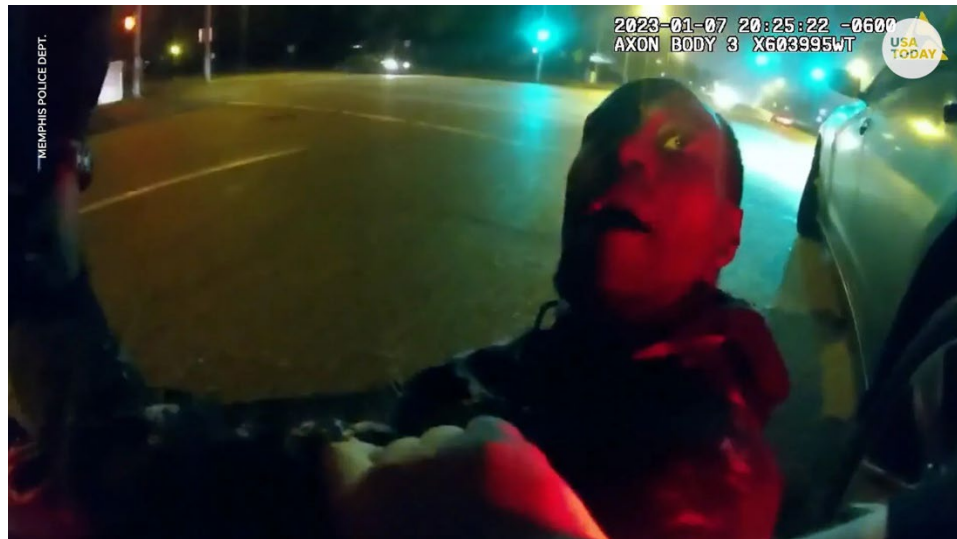
Tyre looking up at Officers terrified and confused as to why he was pulled from the car.

172. Officer Hemphill unreasonably escalated the situation by threatening deadly force with a cooperative, non-violent, non-resistant individual.